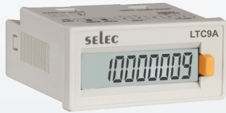
24 x 48mm